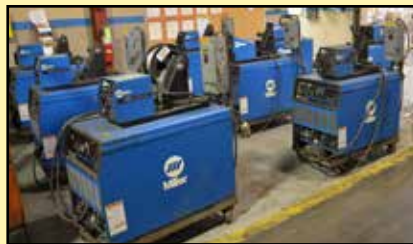
(35+) MILLER & LINCOLN Welders