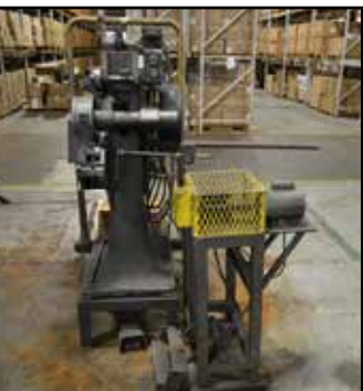
CONTINENTAL Vertical Tube Cutoff Saw