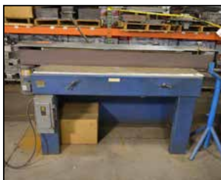
RITTER 6" Horizontal Belt Sander