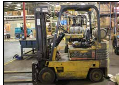
DAEWOO GC25S-2 5,000-lb. Forklift