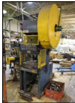
ROCKFORD 40-Ton OBI Punch Press