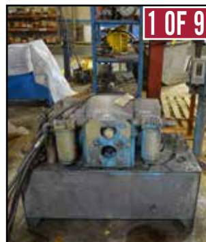
(9) Hydraulic Pump Stations