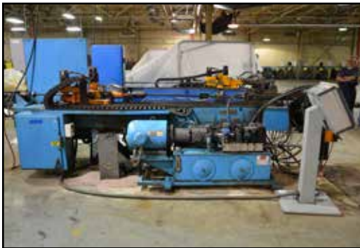
EATON LEONARD VB300-RH 3" Hydraulic CNC Tube Bender