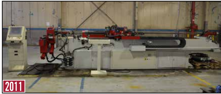
ALPINE CNC100HS-RBH 4" Single Stack Hydraulic CNC Tube Bender