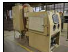
(4) EMPIRE Pro-Finish Blast Cabinets