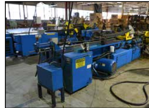
EATON LEONARD VB300 3" Hydraulic CNC Tube Bender