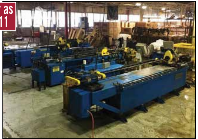
(15) EATON LEONARD, ALPINE, KEINS, HORN (HMT) & PINES CNC Tube Benders