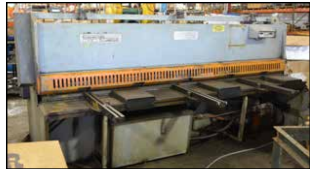
EDWARDS Truecut 1/4" x 120" Hydraulic Shear

LN-7 Wire Feeders MILLER CP-200 Welder w/Millermatic Wire Feeder LINCOLN Square Wave TIG 255 Welder w/Magnum Wire Feed LINCOLN Electric LN-7 Wire Feeder (7) Oxygen Acetylene Torch Carts w/Regulators & Torches (15) Barrels of 0.035 Dia. Welding Wire w>Loading Cones Welding Curtains