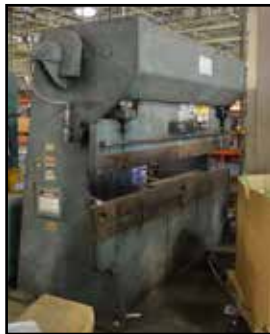
CHICAGO 90-Ton Press Brake