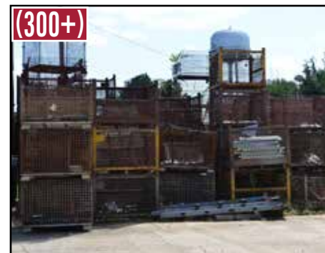
(300+) Various Size Wire Baskets