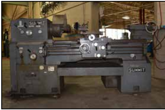
SUMMIT 18" x 48" Toolroom Lathe