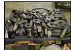
Extensive Assortment of Tube Bending Tooling