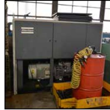
ATLAS COPCO Air Compressor