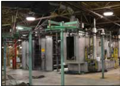
CINCINNATI Paint Line & Complete Finishing System

PRESORTED FIRST CLASS MAIL U.S. POSTAGE PAID CINCINNATI, OH PERMIT NO. 5714