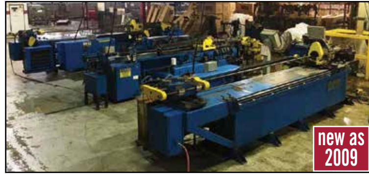
(3) HORN (HMT) 2RCNC & 2LCNC 2" and EATON LEONARD VB30 3" Hydraulic CNC Tube Benders