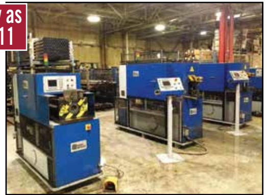
(30+) EATON LEONARD, ADDISON MCKEE & EAGLE Tube Cutoffs & End Formers