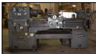
(3) Toolroom, Engine & Turret Lathes