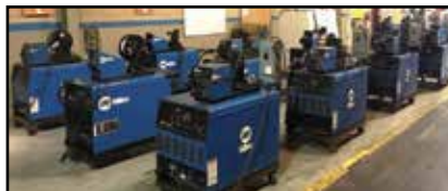
(35+) MILLER & LINCOLN Welders