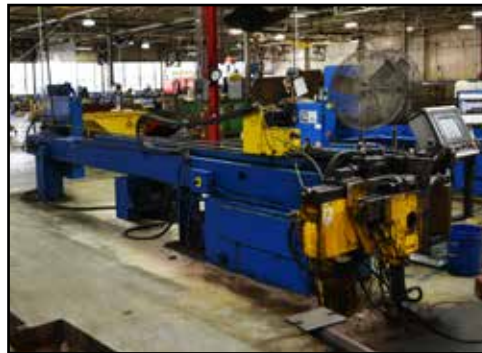
EATON LEONARD VB300C-MP 3" Hydraulic CNC Tube Bender