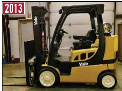
2013 YALE GLC080VXNG 8,000-lb. Box Car Special Forklift