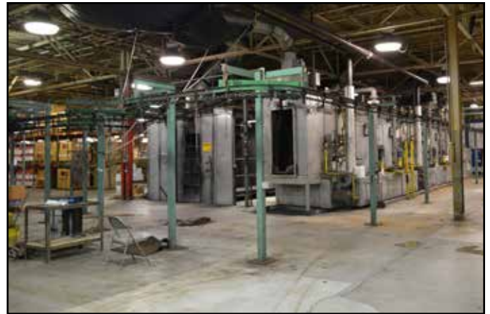
CINCINNATI Paint Line & Complete Finishing System

Inspection: Day Prior to Auction from 9AM-4PM