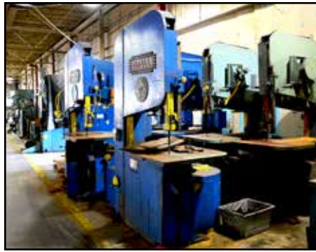
(10+) DOALL & TANNEWITZ Vertical Band Saws