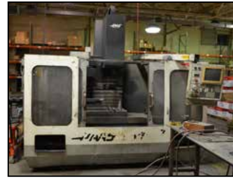
HAAS VF-3 CNC Mill