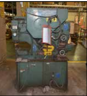
MUBEA 48-4 Ironworker KBL Shear/Notcher