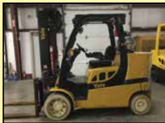
(4) Forklifts to 12,000-lb. Capacity, New as 2013