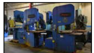
(10+) Vertical Band Saws