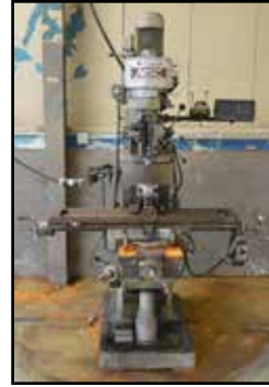
MSC Vertical Radial Drill Press