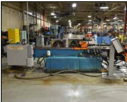
EATON LEONARD 3" Hydraulic CNC Tube Bender