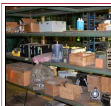
Large Tool Crib w/Motors, Gears, Bearings, Seals & Replacement Bender Parts