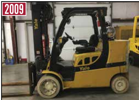
2009 YALE GLC120VX 12,000-Lb. Forklift