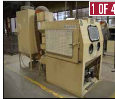
(4) EMPIRE Pro-Finish PF4848 Blast Cabinets