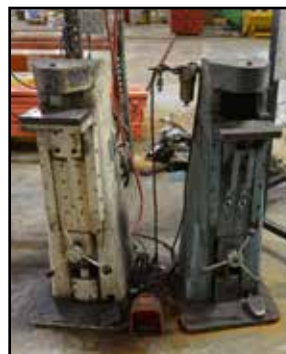
(2) SCHMIDT Marking Machines