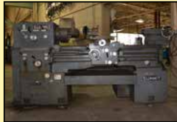
(3) Toolroom, Engine & Turret Lathes