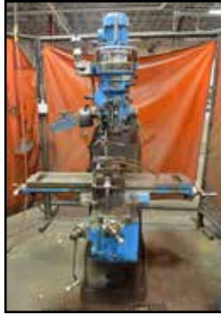
KONDIA Powermill FV-1 Mill