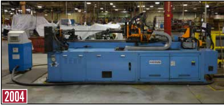
KEINS KBB-50ND 2" Hydraulic CNC Tube Bender