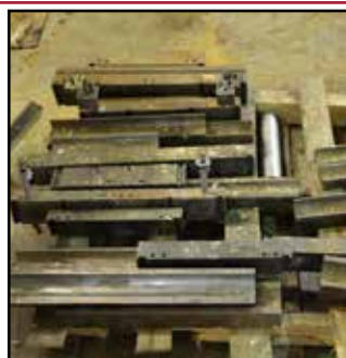
Extensive Assortment of Tube Bender Tooling