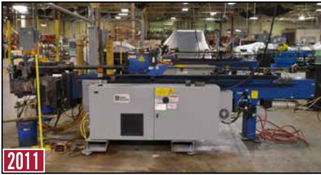
(2) EATON LEONARD VB42 1.75" Electric CNC Tube Benders