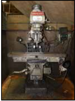
GANESH Deluxe GMV-5 Vertical Mill