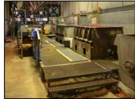
(4) VIBETECH THT-3070 Vibratory Finishers