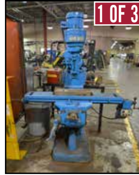
(3) BRIDGEPORT Vertical Mills