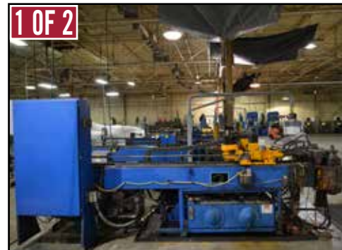
(2) EATON LEONARD Tulip-42 1.75" CNC Tube Benders