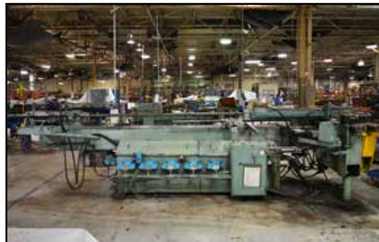
LEONARD 4" Precision Hydraulic CNC Tube Bender