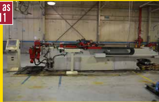
(15) EATON LEONARD, ALPINE, KEINS, HORN (HMT) & PINES Tube Benders